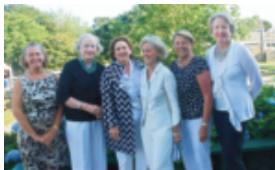
Fundraising Events Committee